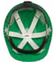
Ratchet textile suspension