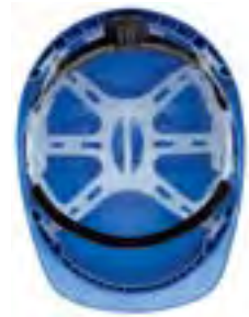
Plastic ratchet suspension